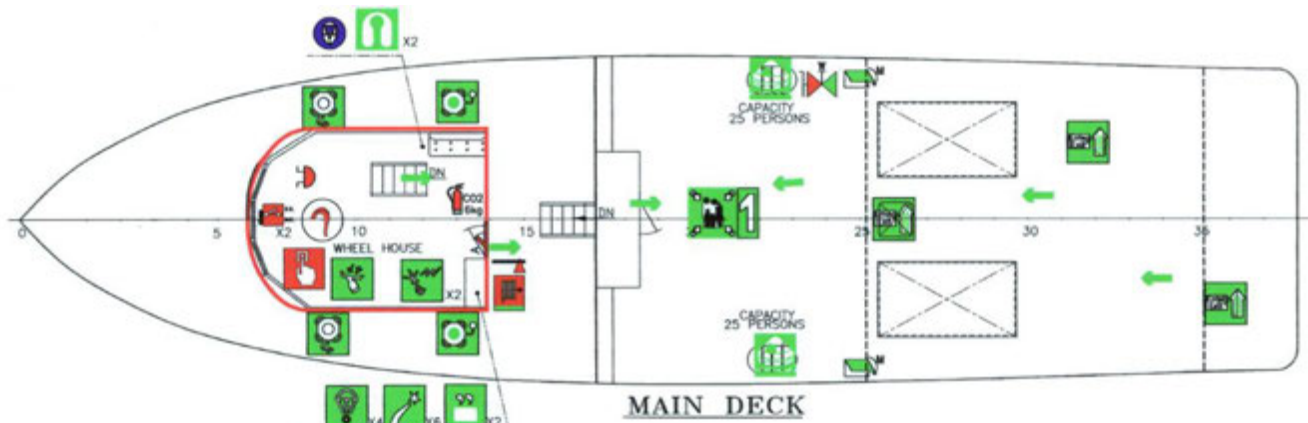
MAIN DECK VIEW